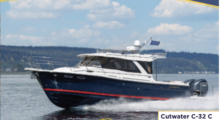
Cutwater C-32 C