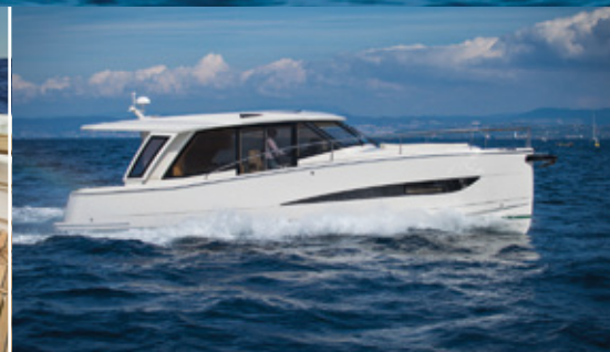
GREENLINE 39 IN STOCK