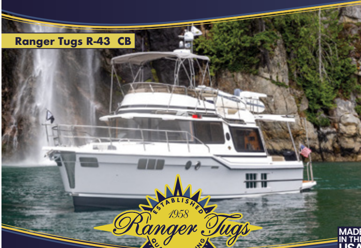
Ranger Tugs R-43 CB