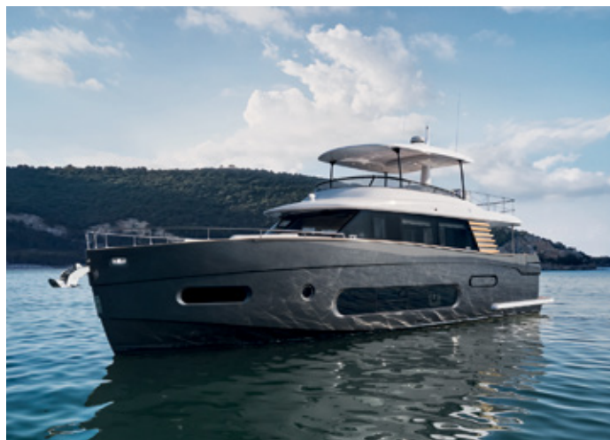
2023 | AZIMUT 66 MAGELLANO