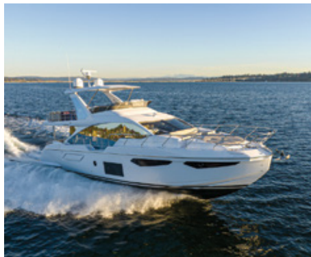
2023 | AZIMUT 60 FLYBRIDGE