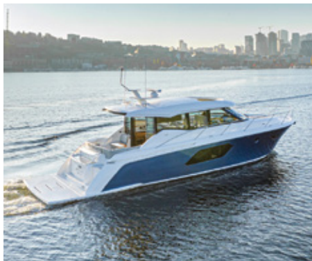
2023 | TIARA YACHTS 49 COUPE