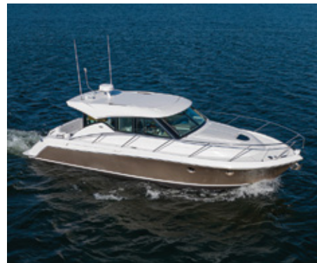
2023 | TIARA YACHTS 39 COUPE