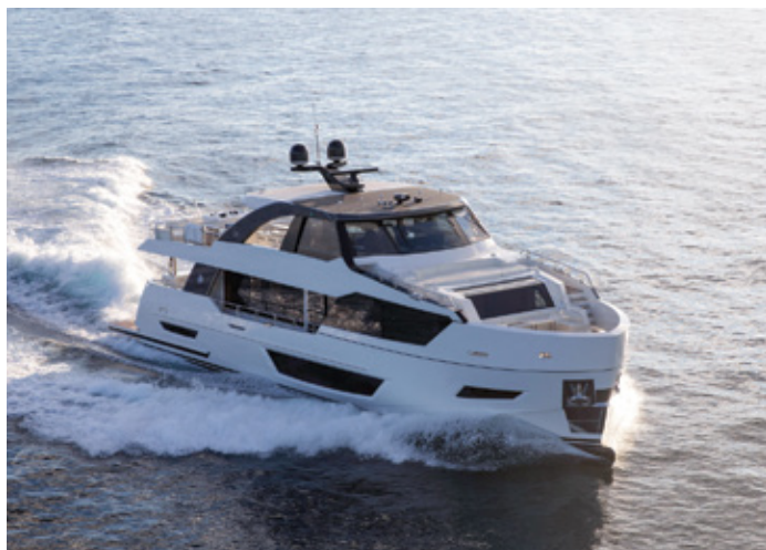
2024 | OCEAN ALEXANDER 27R

YACHT SALES | NEW CONSTRUCTION | BROKERAGE