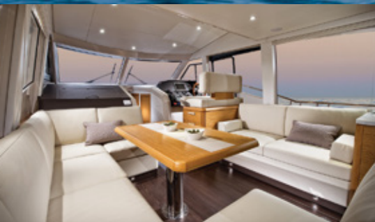
GREENLINE 48 IN STOCK